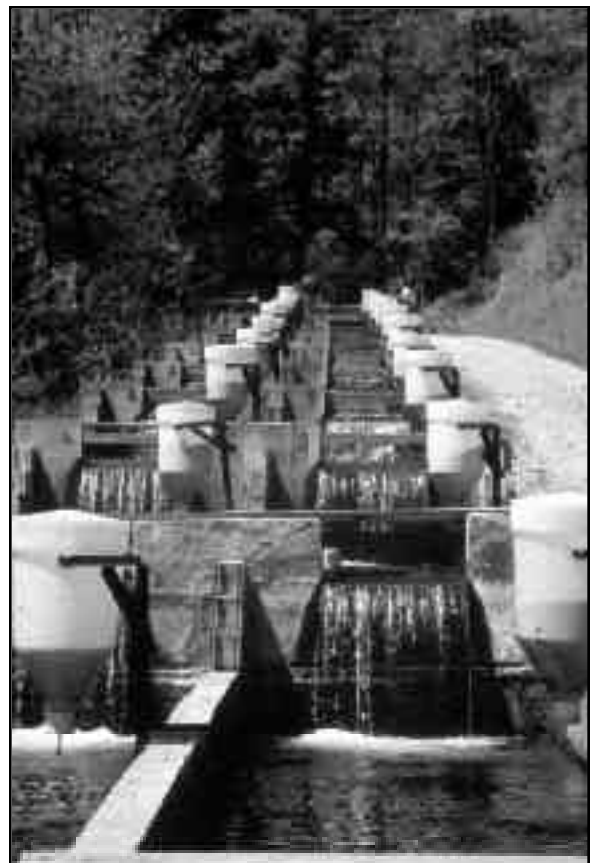
Figure 1. Serial water reuse in a Southern Appalachian trout farm.

accumulation of carbon dioxide from the fish. The farm's oxygenation and aeration systems should be able to remove carbon dioxide from the water.